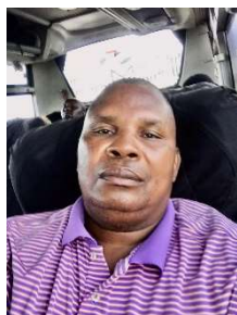
Traveling to Kenya