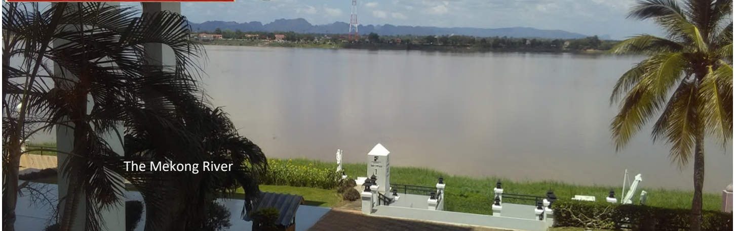
The Mekong River